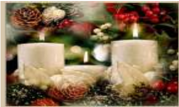
Advent by Candlelight

We will be hosting " Advent by Candlelight " on Monday, December 4th beginning at 7:00 p.m. in the parish hall. Come share faith and fellowship as we take time out of our busy schedules to remember the true meaning of the season. Invite your family and friends. If you would like to host a table, please call the rectory at 419-224-3080. Hope to see many of you there!