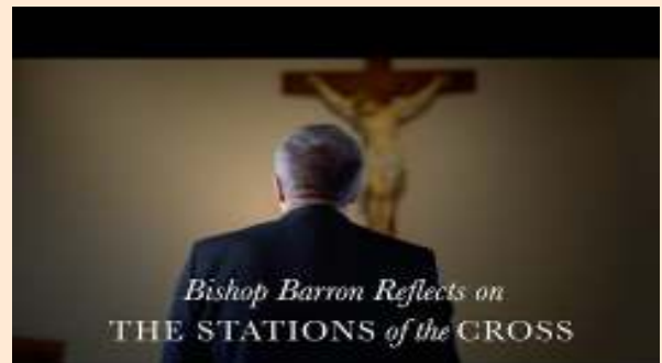
Bishop Barron Reflects on THE STATIONS of the CROSS

God as we walk through Holy week toward the cross, May we remember the wonder of who you are. Beyond sin your love is inexhaustible, Beyond brokenness your forgiveness is incomprehensible. Beyond betrayal your grace is poured out eternally, Beyond death your life is unimaginable. Beyond human understanding, Your ways are always higher than ours.