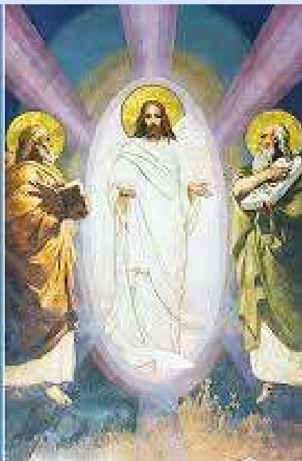
Feast of the Transfiguration of the Lord